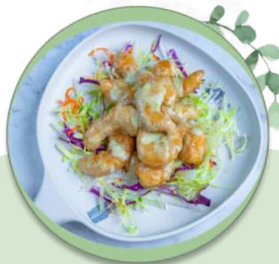
Wasabi Mayo Prawns