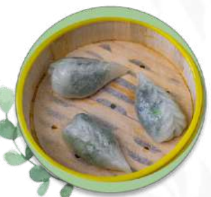
English Spinach Dumplings