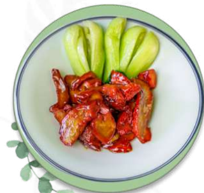
BBQ Char Siew