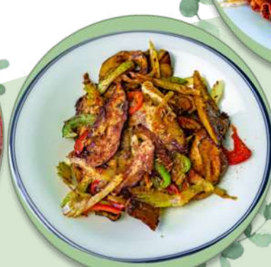
Stir Fried Beef with Cumin and Pepper