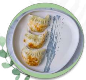
Pan Fried Chinese Cabbage