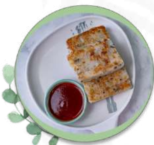
Pan Seared Radish Cakes