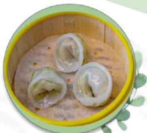
Broccoli, Carrot, Ginger Dumplings