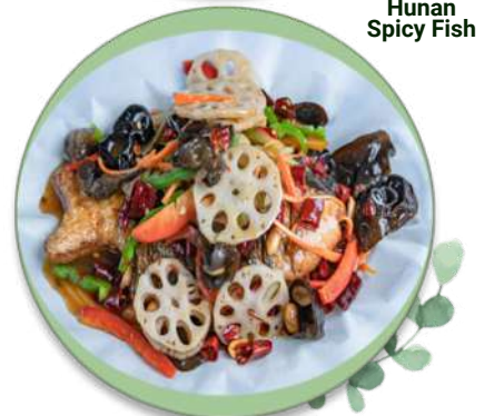
Hunan Spicy Fish