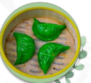
Pandan Flavour, Choysum Dumplings