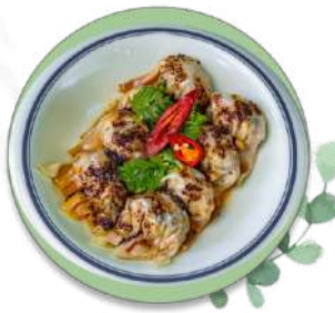
Wonton in Homemade Spicy Sauce