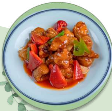
Sweet and Sour Pork