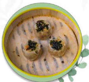
Vegetarian Siu Mai