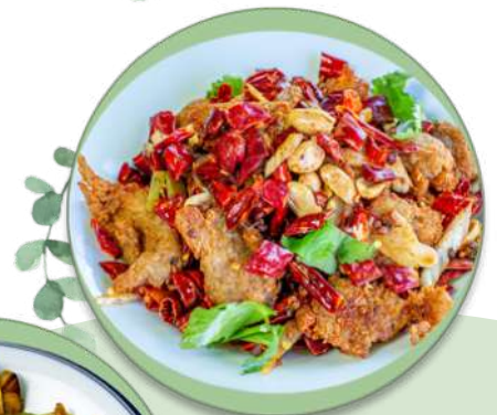
Szechuan Chilli Chicken