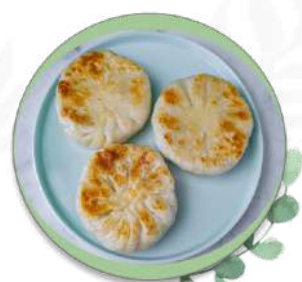
Pan Fried 'Duck' with Broccoli Dumplings